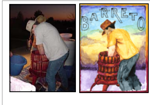
Life becomes art.