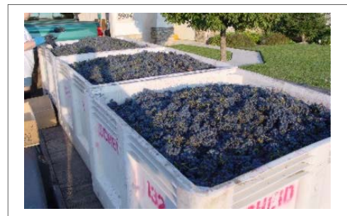
2000 Cabernet Sauvignon fresh from the vineyard.

crushed with the idea in mind of making a fortified, white port style, desert wine.