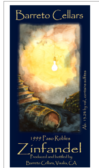
Label for premier Zinfandel Release