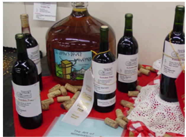
1999 Zinfandel Takes 3rd place in the red variatal competition at the Tulare County fair.

Tulare CA- A pre-release bottle of Barreto Cellars 1999 Zinfandel was submitted for evaluation at the 2000 Tulare County Fair, and was awarded 3rd place in the red variatal class. The class contained 8 entrants from Kingsburg to Porterville. The Barreto Cellars 1999 Zinfandel is a unique handcrafted wine that takes on a flavor profile that is reminiscent of its old world Portuguese/Italian heritage. The wine is full of fruit flavors characteristic of Zinfandels including cherries, and berries. Little of these favors have been masked by preventing Malolactic Fermentation, also giving the wine a strong acid backbone which will provide for cellaring potential or pairing with rich Italian pasta dishes. The finish ends on notes of branded cherries, indicative of its aging for 10